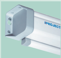
Integrated mounting brackets