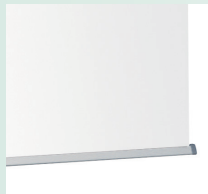
Triangular slat bar