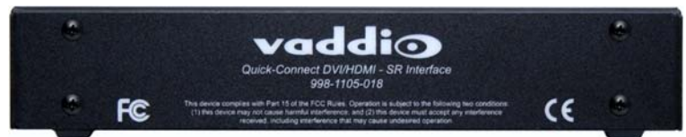
Figure 2: Front Panel of the Quick-Connect DVI/HDMI - SR Interface (Optional Accessory Rack Mount Panel Available)